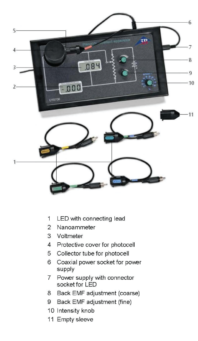
FIG. 2. This figures shows the equipment used in the Planck's Constant Apparatus. The different parts of the unit are described in the legend below the picture. Four of the five LED cables are show below the apparatus while the fifth LED is powered by the box and installed into the photocell assembly.

A picture of the equipment is shown in the instruction manual as well as in Fig. 2 (see below).